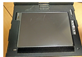
AC931690 (Tablet Prime)