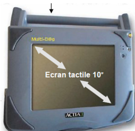
AC921407 (Tablet Master 10")