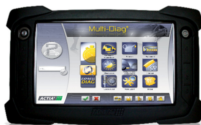
AC931744 (Tablet Pocket 2)