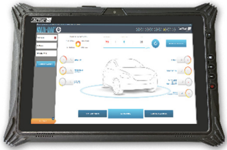
AC600578 (TABLET XM3)