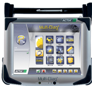
AC921519 (Tablet Master 12")