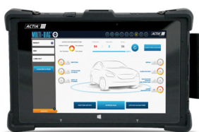
AY14600196 (TABLET XM)