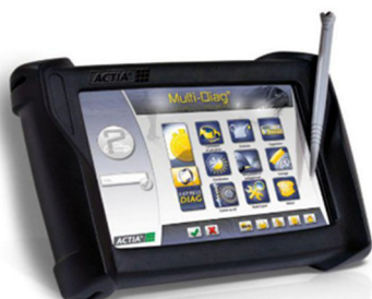
AC931701 (Tablet Pocket)