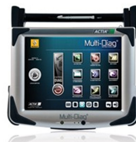
AC921802/004 (Tablet Master 2)