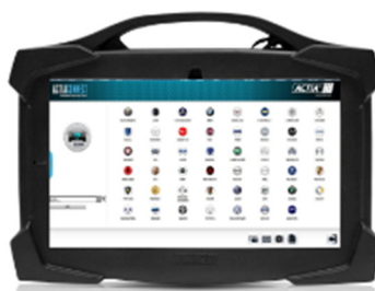
AC966694 (Tablet XG Mobile Evo)