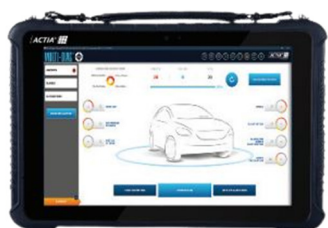
AC969249 (TABLET XM+)