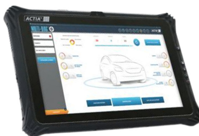
AY14600255 (TABLET XL2)