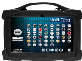
AC966692 (Tablet XG Mobile)