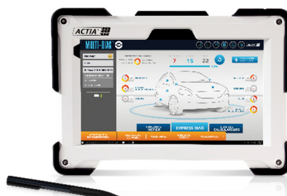
AC968150 (Tablet Mobile 3R)

And declination: AC968151 MOBILE 3R MD TRUCKS / AC968152 MOBILE 3R AD CARR / AC968153 MOBILE 3R MD4DB / AC968154 MOBILE 3R BOLLORE / AC968155 MOBILE 3R MOTRIO