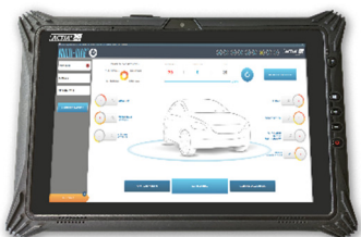
AC600578 (TABLET XM3)